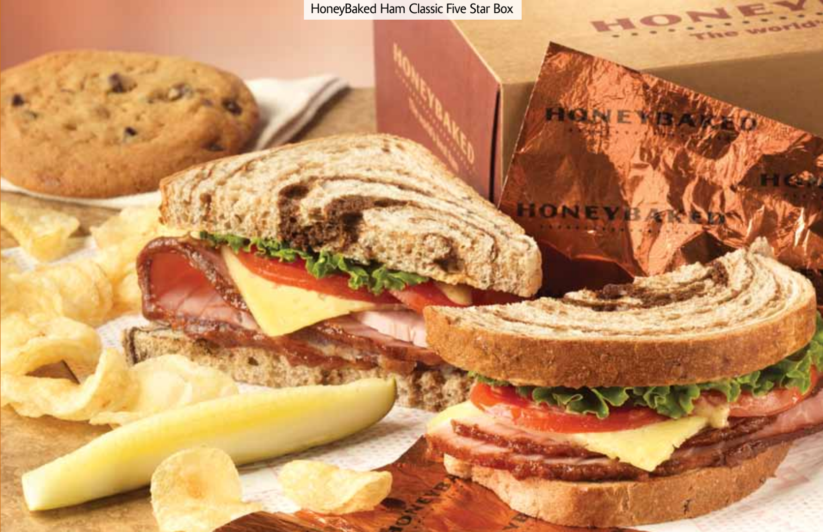
HoneyBaked Ham Classic Five Star Box