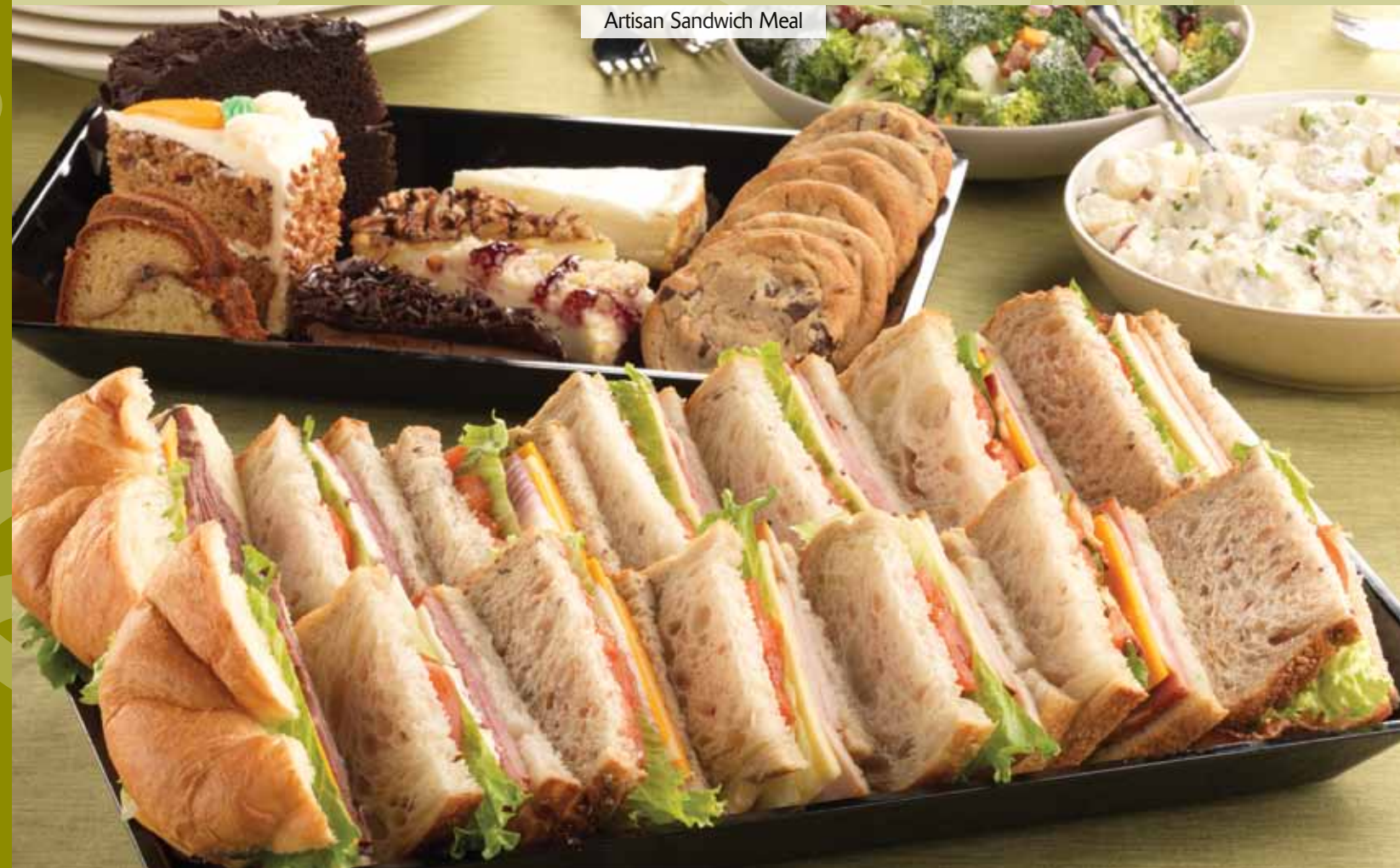
Artisan Sandwich Meal